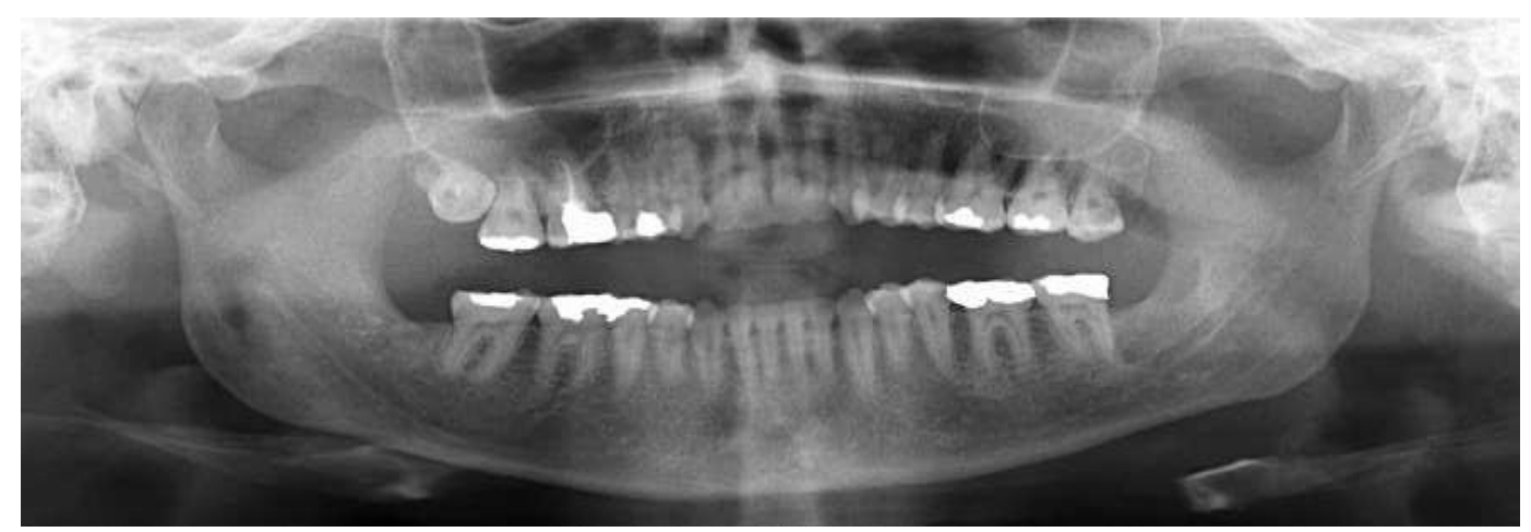
Figures 3a and 3b: Showing removed third molar